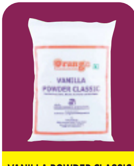
VANILLA POWDER CLASSIC