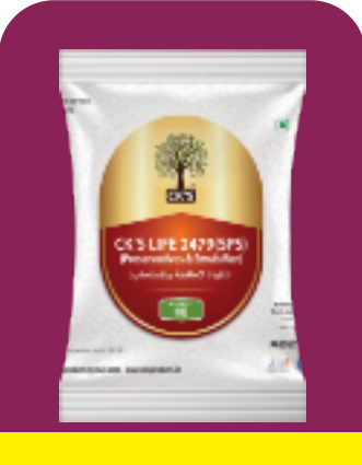
CK'S LIFE 2479