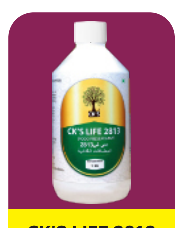
CK'S LIFE 2813