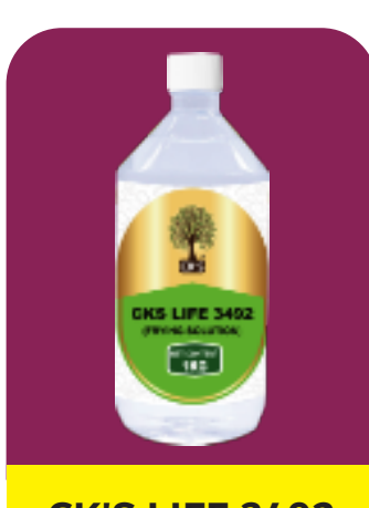
CK'S LIFE 3492