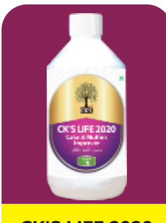
CK'S LIFE 2020