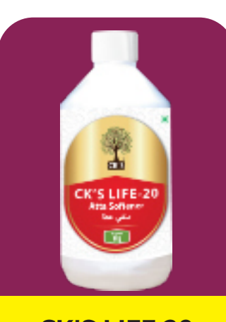
CK'S LIFE 20